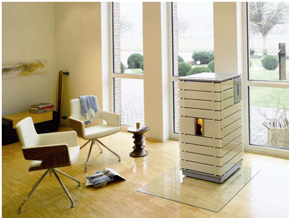
The hearth returned to the heart of the home: wodtke pellet stove boiler ivo.tec with glass décor "Latte M"

We would be glad to send you illustrated material. Please contact us.