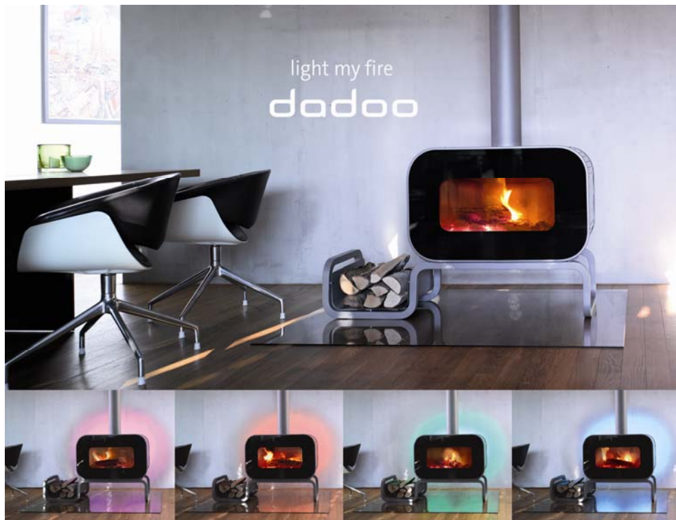
Fire in form – with “dadoo”, an exceptional wood-burning stove in every respect, wotke offers a penetrating look into tomorrow's world of wood-burning stoves.