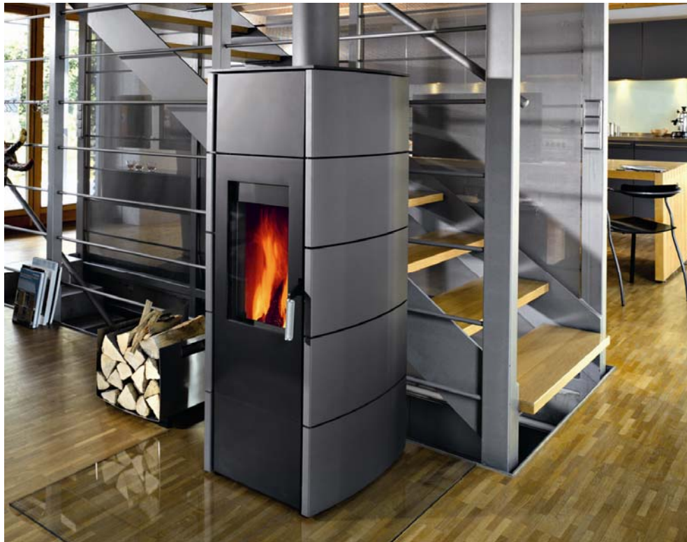
wodtke Water+: TIO, a wood-burning stove by wodtke, not only produces pleasant warmth and a fascinating play of flames; it also directs a large part of the thermal energy it generates to the central heating system and is thus ideally suitable for integration with solar energy.